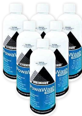
200ml per bottle